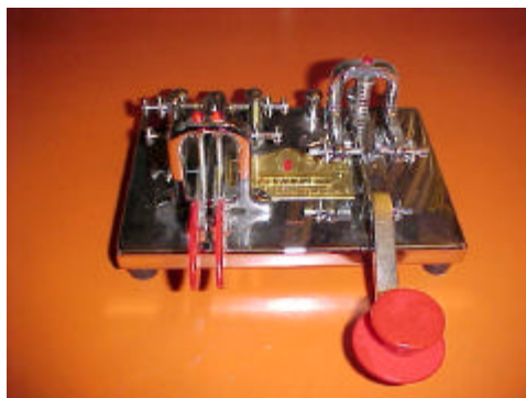
One-off Vibroplex Original/J-38